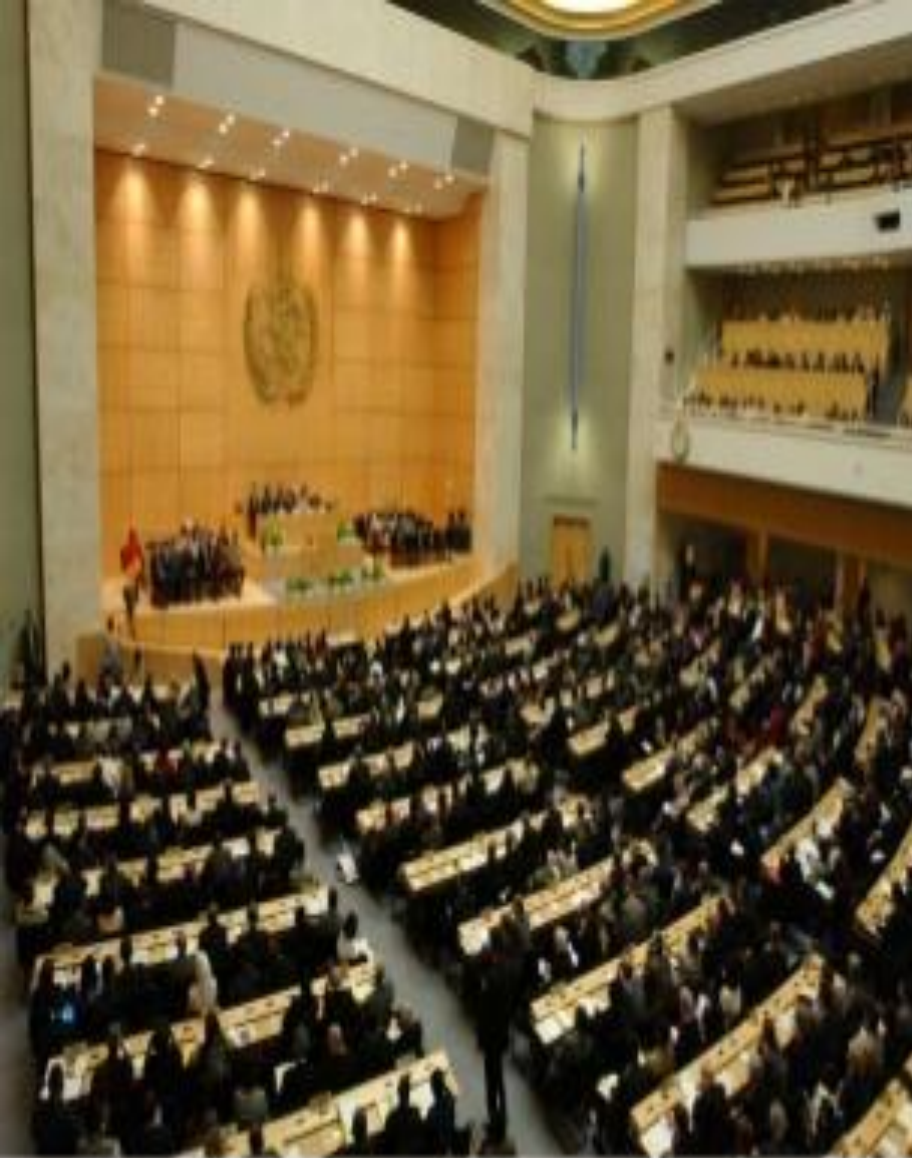
World Health Assembly